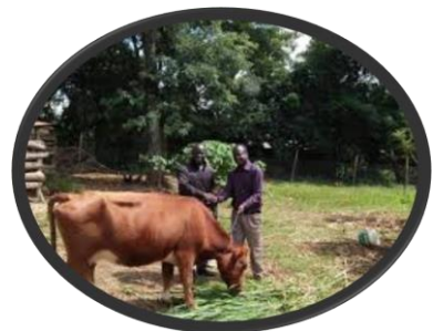
Stock feed stalks and cake